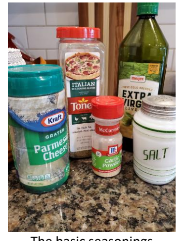
The basic seasonings